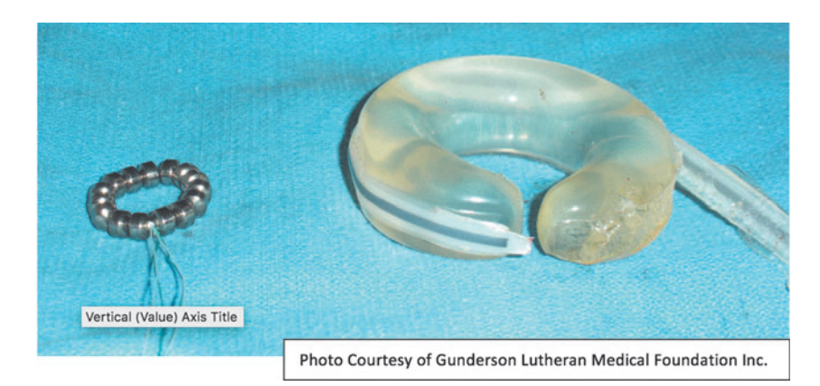
FIG. 3. Comparison of Angelchik device and magnetic sphincter augmentation device.

Rates of erosion and migration complications after magnetic sphincter augmentation compare very favorably with the most common surgical treatment of GERD today, esophagogastric fundoplication, whereby fundoplication-related complications such as suture or pledget erosion, wrap migration with resulting severe anatomic distortion, vagal nerve damage,<sup>25</sup> or failure requiring reoperation occur in up to 20%