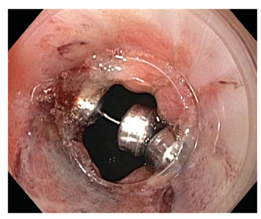
Fig. 3 Endoscopic view of eroded beads. When put on tension, the wire in between two beads becomes visible

Similar to other implanted devices, the magnetic sphincter is susceptible to infection. Once inoculated, it is very unlikely that bacteria will clear. Inflammation and smoldering infection may produce localized tissue necrosis and resulting erosion. Unfortunately, cultures of explanted devices are of little clinical utility as exposure to upper gastrointestinal intraluminal bacteria makes it impossible to delineate the true infectious source. Minimal handling of the device once outside of sterile packaging and immediate insertion into the body may reduce this risk.